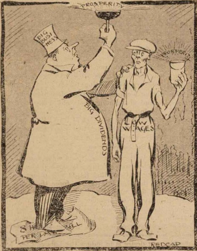
"PULL TOGETHER." "MY GOD! WHAT A NATION OF HEROES WE ARE."