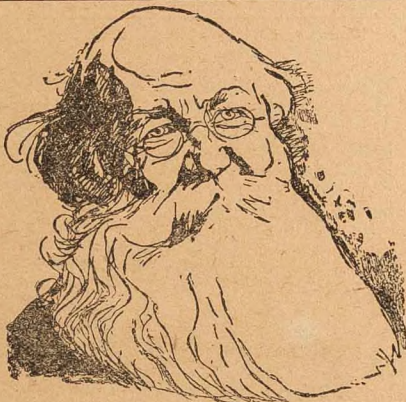
Born December 9th, 1842, at Moscow. Died February 7th, 1920, at Dmitrov, near Moscow.

"The great influence of Kropotkin is due to the fact that in him the scientist, the author, the propagandist and the friend are blended in harmonious unity, forming the most 'human' man I ever met. He loves mankind. Everything he thinks, everything he does is determined by this great love of his, which is the deep-seated quality of his mind."