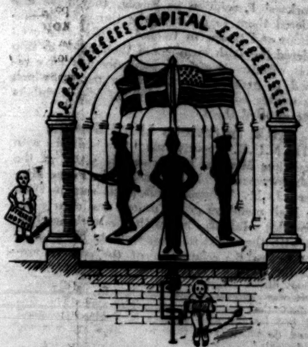
The Vicious Circle.

Here are copies of the actual letters, lest any worker has failed to read them: