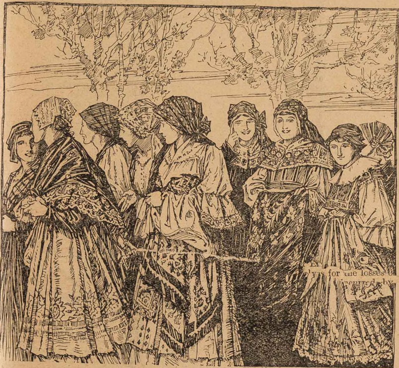
WOMEN OF THE NEW CZECHO-SLOVAK REPUBLIC, where, as in all the neighbouring countries, Bolshevism is rapidly spreading.