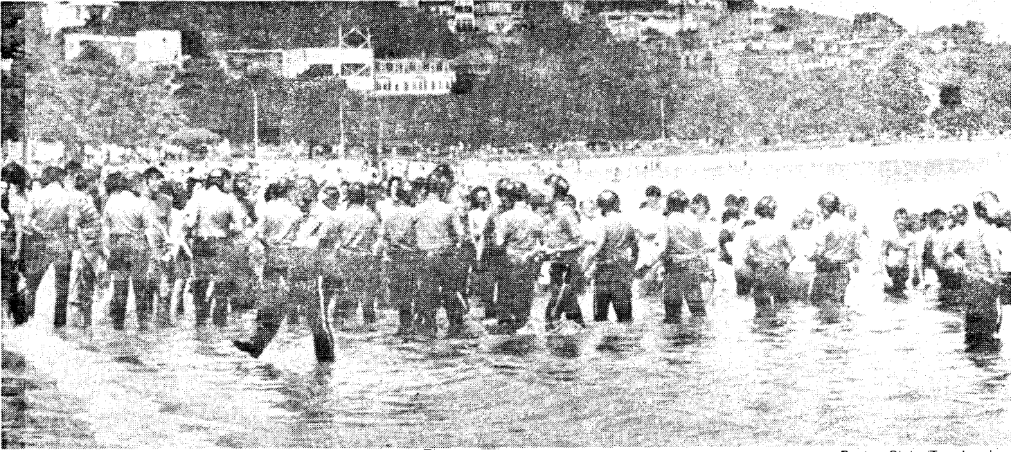
Boston cops form barricade between black and white demonstrators at Carson Beach.

In the tense weeks preceding school opening a grim scenario is unfolding. Phase Two opens new areas of the city to the busing program although one allwhite neighborhood, East Boston, will remain segregated. The extension of busing into these areas, especially Charlestown (a social and ethnic mirror image of South Boston), will almost surely be met with violence by the racists, who have demonstrated the ability to mount large armed mobs on a few hours' notice. Black children may pay in blood for the crimes of reformist misleaders who preach reliance on cops and courts to secure and defend the democratic rights of black people. For their part, the Boston Police Patrolmen's Association has made its sympathies amply clear by its financial contributions to ROAR, the umbrella anti-busing organization. In the many attacks on black people, the police have either been conspicuously absent (as on the first day of school last September when a mob of white youth had a free hand in trashing school buses taking black children home from South Boston) or else criminally slow to act (as in October when a black Haitian worker was dragged from his car and nearly beaten to death, or in December when a lynch mob kept black students trapped in South Boston High School for several