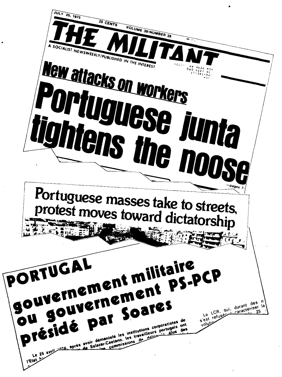
SWP distorts nature of rightist mobilization in Portugal while OCI calls for Soares government.

There are numerous eyewitness accounts in the bourgeois press of the reactionary tenor of these demonstrations, but the Militant dismisses them all