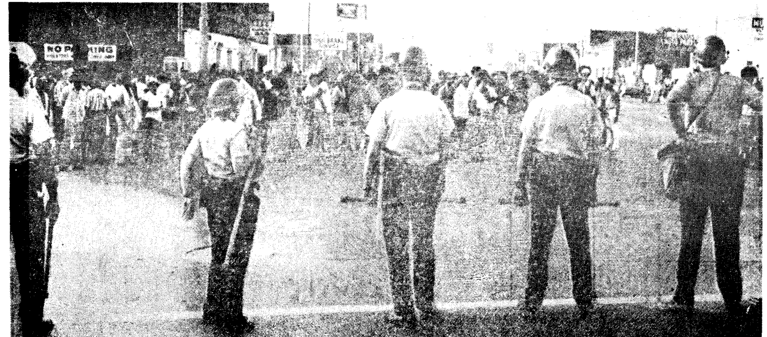
Detroit, July 29: cops move against black youths protesting killing of Obie Wynn.