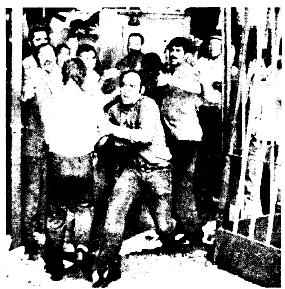
Workers storming Ford plant during Cologne wildcat.

The official discrimination against foreigners, in turn, retards their capacity to compete with native workers in the market. The foreign workers are often handicapped by language, peasant origins and accordingly higher accident rates, etc., so that em-