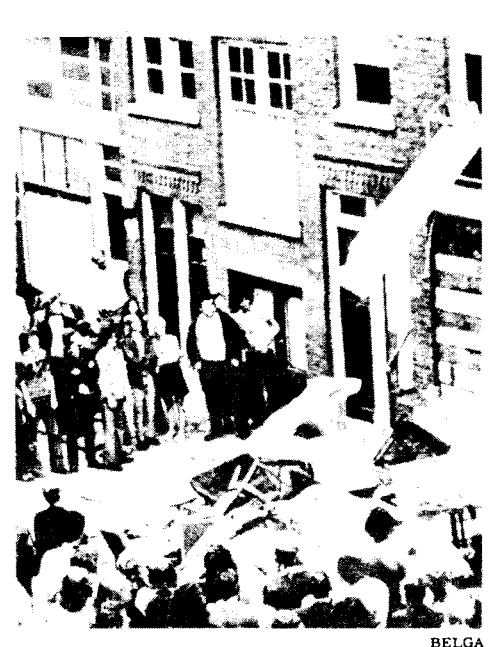
Wreckage caused by an anti-Turkish riot in Rotterdam, 1972.

Foreign workers in West Europe should not be regarded as already an unconscious vanguard in the manner of the fake-Trotskyist United Secretariat's "new mass vanguard." The term "vanguard" implies conscious adher-