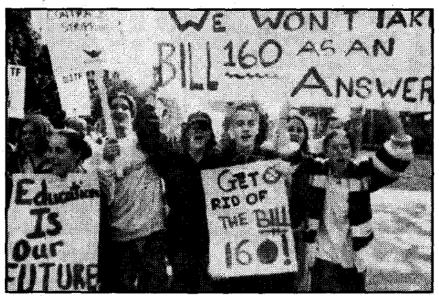
Windsor high school students protest Bill 160 cutbacks.

An estimated 15,000 teachers and supporters from across Ontario rallied in Toronto on Nov. 6, only days before the strike was called off. Many teachers reportedly were angered about the decision to go back to work, with