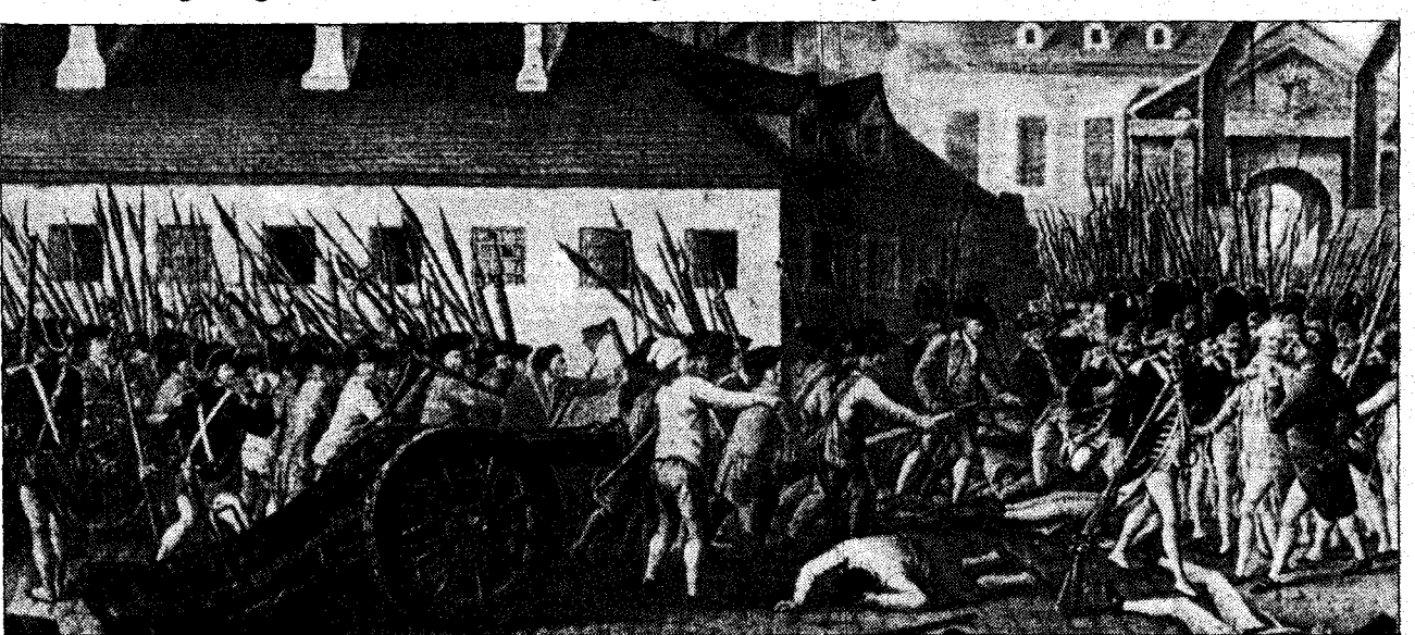
The storming of the Bastille in 1789

So what is the dialectic but the movement of both ideas and of masses in motion towards the transformation of reality? This is in contrast to the lack of all meth-