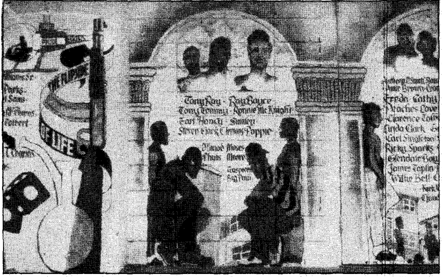
Watts community mural: "Crossfire (The First Word on Peace)"

What happens to youth caught in this deteriorating order has become the subject of intense debate by social scientists, some of whom have gone so far as to theorize that Black youth are genetically prone to violence. Oth-