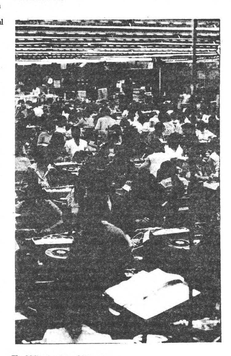
The Militarization of Women

The conditions described by the New York Times are precisely conditions faced by the garment and textile workers in the 19th and early 20th century. They are the same conditions that the workers we remember on International Women's Day fought against so long ago. So much for the great advancement of working class women!