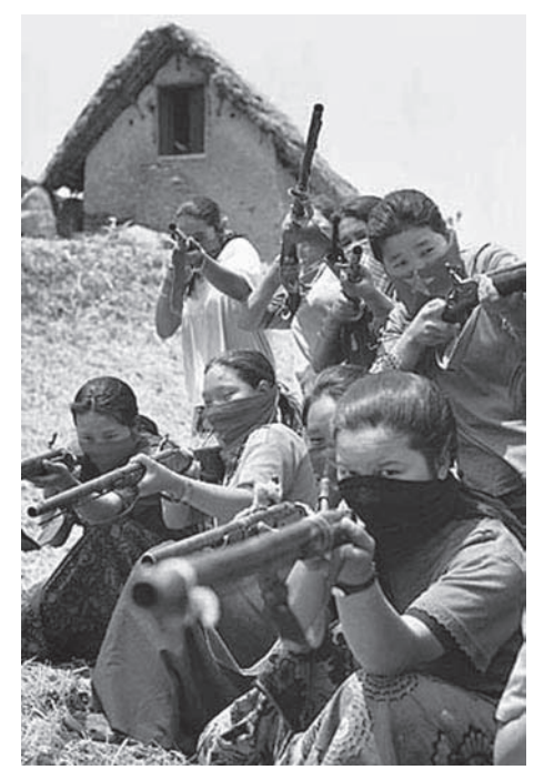
liberties and freedom for opposition parties have been restored, so the three governments can justify the resumption of military aid the monarch needs to fight the popular insurgency.

Gyanendra's one-man rule made it hard for the governments of the U.S., India and Britain to continue their open support for his regime. So he declared that the 100 days had been successful and that the revolutionary forces were significantly diminished. He also wants to give the appearance that civil