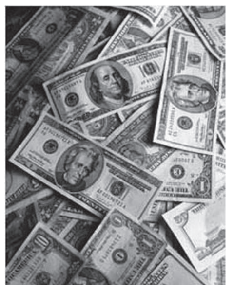
Capital's response to these exigencies has been threefold: (1) a stepped-up class war; (2) an attempt to increase the size and activity of the pump (but, consistent with the class war from above in terms that primarily serve capital); and (3) a growth of imperialism (including economic globalization) and war.

At the root of this problem is the effective banning of price competition in the more mature, consolidated industries. Prices as a whole tend to go only one way—up. This means that competition is not eliminated but channeled into areas such as cost-saving innovations and marketing. Increases in productivity do not generally lead to lower prices or increased real wages, instead they end up feeding the surplus in the hands of corporations and the wealthy. The result of all of this, however, is to create overaccumulation and a shortage of effective demand in the economy as a whole.