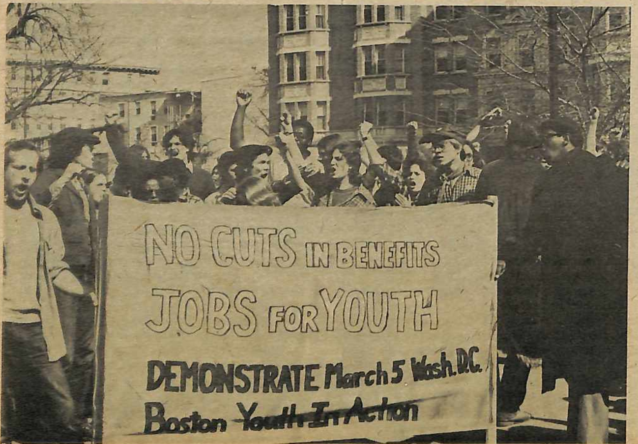
The capitalists come up with nothing but phony job schemes for youth, offering them jobs at slave wages or getting them to work for peanuts in jobs that have been taken away from their parents. In D.C. March 5, youth put them on notice they weren't accepting this future and would fight alongside their parents for jobs and a decent life.

The task is now to go back to the neighborhoods and cities, deepening the understanding of points that were taken up at the meeting while putting many of the ideas and plans talked about into practice that will unite youth to fight the bourgeoisie and change the world. This ranges from developing the campaign around African liberation to the battles for jobs, and the study of Marxism-Leninism. In all these ways the various youth groups will make important steps towards building a powerful working class youth section of a young communist organization that will dare to stand up and change the world, and lead the youth and students to become a powerful social force that will stand for revolution, become a powerful and valuable ally of the working class in its war for freedom.