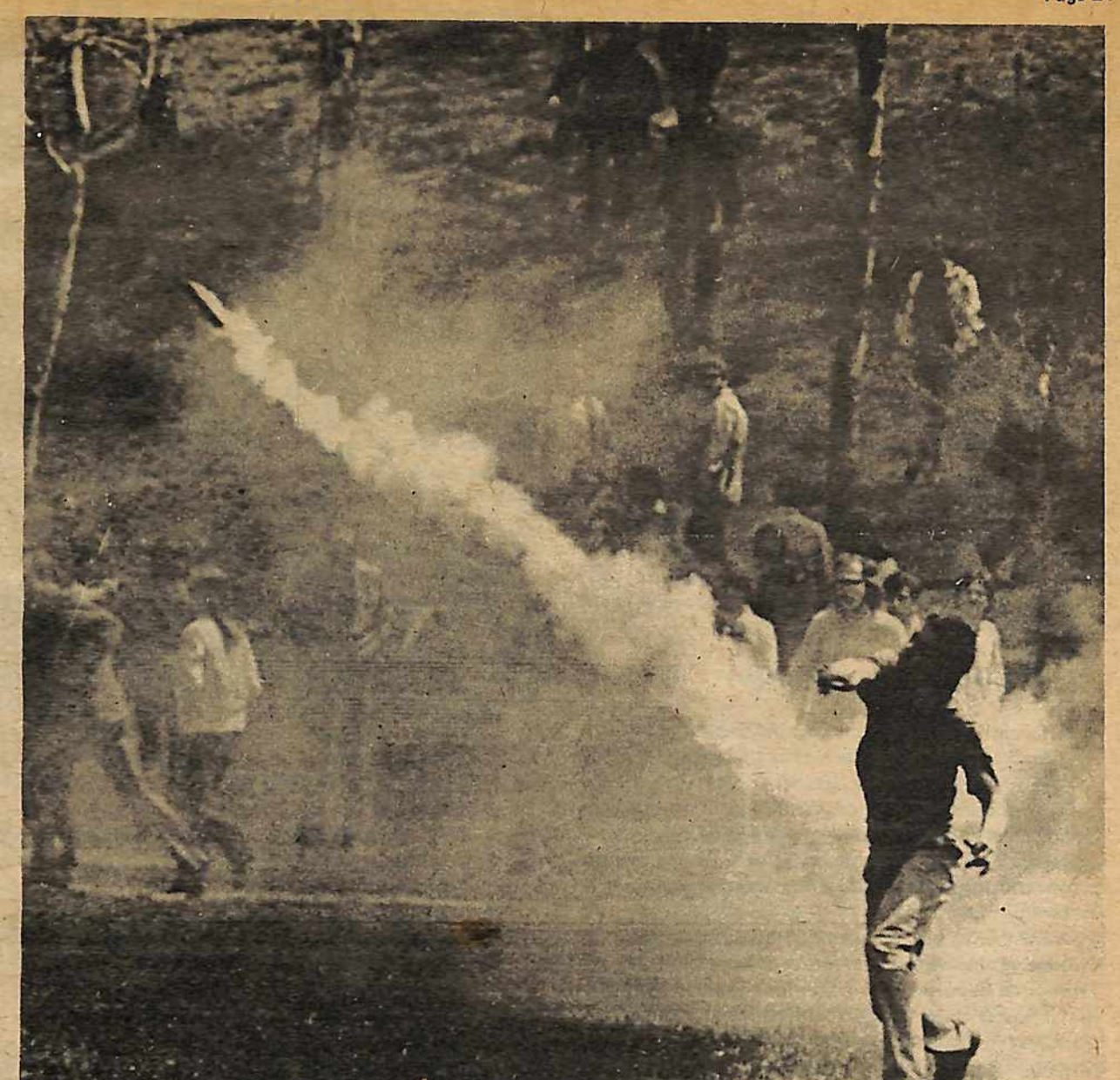
Students and youth have historically been in the forefront of the peoples' struggles against the imperialists, fighting boldly and militantly. In the '60s, they were a catalyst for the mass movements that exploded in opposition to the oppression of Blacks and the war in Vietnam.