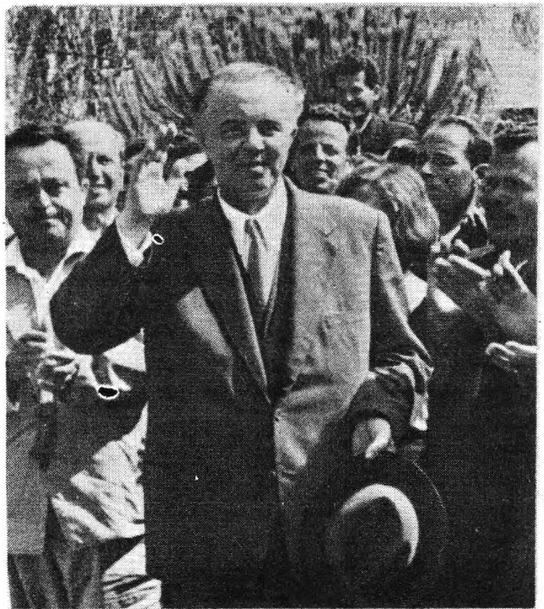
Enver Hoxha, First Secretary of the Party of Labor of Albania.

Albania is an example to the peoples of the world. A small country, devastated by wars, and surrounded by hostile governments, she has built up her economy through her own efforts. She has created a rich life for her people. She has attained a place of dignity in the world, not by aggression, but by continually exposing reaction and supporting just struggles of liberation.