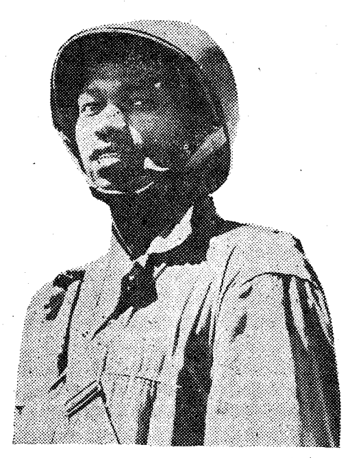
He fights Hitler. Don't fight him, by failing to combat racism.

and damaging anti-Negro outbreak in that city. And that concentration upon Detroit is, in turn, because it is the city of highest concentration of war production!